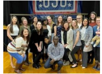
Volunteer Appreciation 2019

Have you ever wanted to feel like you are part of your Marine or Sailor's unit? A great way to do that is to become part of the Unit and Family Readiness Program as a Family Readiness Assistant or Volunteer. As a Family Readiness Assistant, you will play a vital role in helping maintain the readiness of 2 nd Marines "Marine Family." By becoming a volunteer, you will assist the Deployment Readiness Coordinator (DRC) in planning, coordinating, and execution of unit events. It is also an opportunity to meet other family members in 2 nd Marines and make some friends and you become part of the support group that assists one another and other members of the unit. We welcome you to provide new ideas and to assist with planning unit Family Readiness activities. So, whether you have plenty of time or only a few hours a month, we would love for you to become part of the Family Readiness program! If you would like more information on volunteering, contact the DRC at 910-381-6778. We look forward to hearing from you!