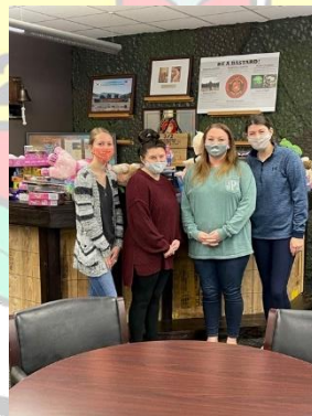
Christmas Gift Assistants (Santa's Elves)