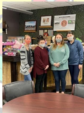
Christmas Gift Assistants (Santa's Elves)