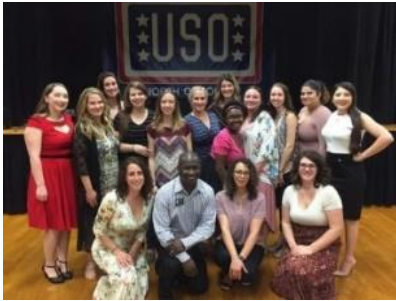
Volunteer Appreciation 2020