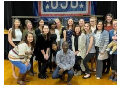
Volunteer Appreciation 2019

Have you ever wanted to feel like you are part of your Marine or Sailor's unit? A great way to do that is to become part of the Unit and Family Readiness Program as a Family Readiness Assistant or Volunteer. As a Family Readiness Assistant, you will play a vital role in helping maintain the readiness of 2 nd Marines "Marine Family." By becoming a volunteer, you will assist the Deployment Readiness Coordinator (DRC) in planning, coordinating, and execution of unit events. It is also an opportunity to meet other family members in 2 nd Marines and make some friends and you become part of the support group that assists one another and other members of the unit. We welcome you to provide new ideas and to assist with planning unit Family Readiness activities. So, whether you have plenty of time or only a few hours a month, we would love for you to become part of the Family Readiness program! If you would like more information on volunteering, contact the DRC at 910-381-6778. We look forward to hearing from you!